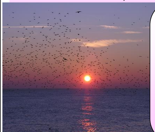
Attribution to Squirmelia

Brighton : Brighton is on the south coast and on hot sunny days this beach gets really crowded. It is a very convenient place for a break for people who live in London. And 'The Pavilion' is interesting historically to visit for a day out.