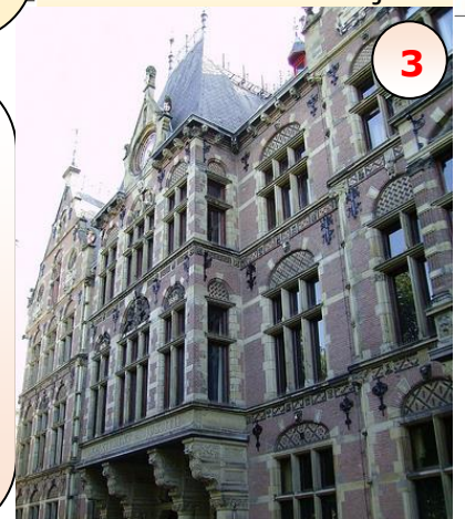
Attribution to Perseplumes

The traditional Dutch buildings in Den Haag have gorgeous, ornate facades. The bricks are in different colours and everybody who sees these buildings stops to admire them. We have our skyscrapers too, but I prefer classical architecture. Arjan