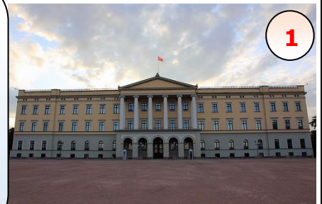
Attribution to Nora**

The Royal Palace is the heart of Oslo. It is a beautiful, classical building. There are many other examples of excellent contemporary architecture, such as the Opera House. I also like them, but the Palace is the best for me. Kristen