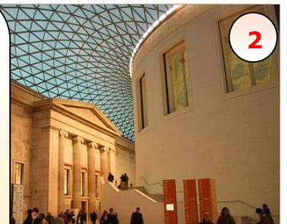
Attribution to aartj

I think that the Great Court in the British Museum is impressive. The ceiling is covered in glass, which is practical for the terrible, British weather. I like its geometric design too. The architect, Sir Norman Foster, is famous for designing it. Hugh