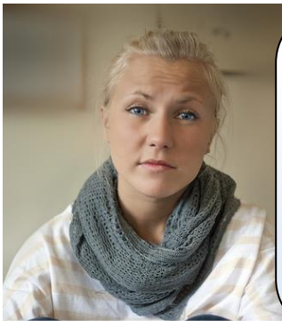
Attribution to Espen Faugstad

Read what the people below have to say about the architecture and buildings they like in their countries. Notice the adjectives they use.