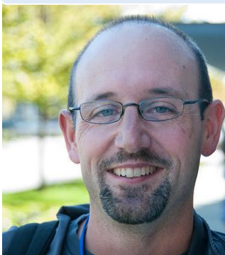
Attribution to djking

I think that the Great Court in the British Museum is impressive. The ceiling is covered in glass, which is practical for the terrible, British weather. I like its geometric design too. The architect, Sir Norman Foster, is famous for designing it. Hugh